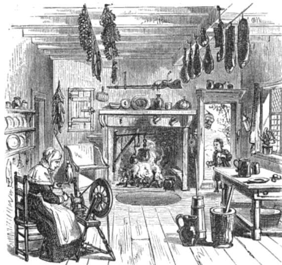
A NEW ENGLAND KITCHEN IN THE OLDEN TIME.